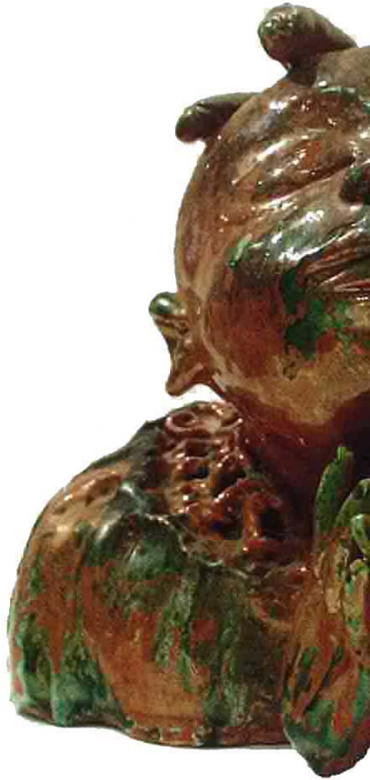
Shepparton Art Gallery and Friends of