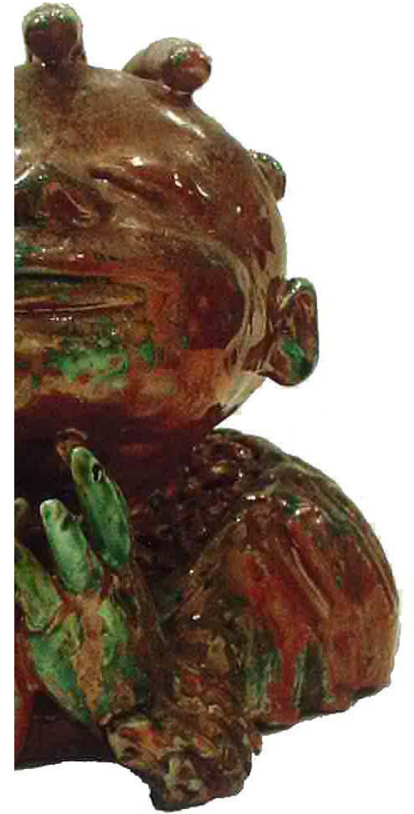
the Shepparton Art Gallery Society Inc.