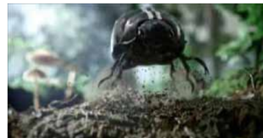
Volkswagen 'Black Beetle'