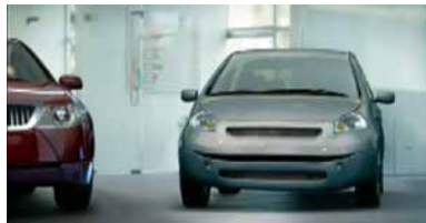
Cars.Com 'Talking Cars'