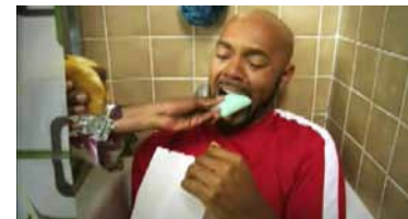
PepsiMax 'Love Hurts'